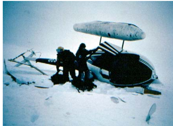
Doug Fessler, long time director of the Alaska Mountain Safety Center, stands beside the Alaska Fish and Wildlife helicopter that crashed in flat light with him on board.

noted that the wind was blowing about 10 knots from the east. xxv