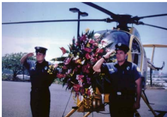
Honolulu Fire Department officials pay respect to their three colleagues who died in the line of duty.