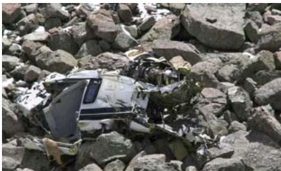
The crash site of the New Mexico State Police Agusta A-109E helicopter.

The 46 year-old pilot and his female subject died from injuries they sustained. The spotter survived, and was located the following morning as he attempted to hike from the rescue scene.