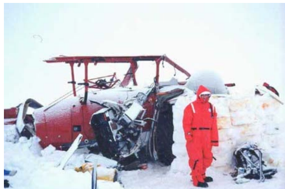
A survivor stands beside the igloo that she and fellow survivors built as an impromptu shelter.

The pilot had slowed the helicopter from 100 knots to 75 knots prior to striking the snow-covered ice field. Although the helicopter was destroyed on a 150-foot long wreckage path, the pilot and passengers all survived. The crash destroyed the ELT antennae, making the radio and ELT inoperable.