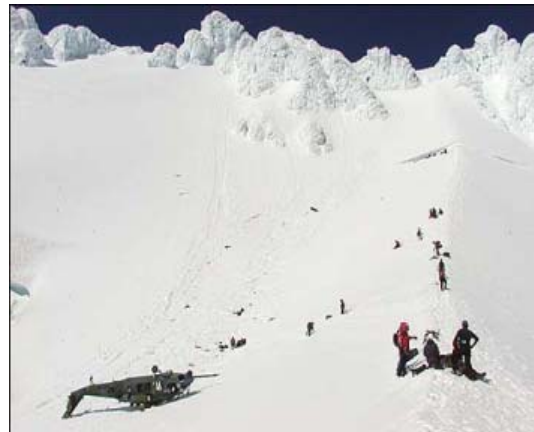
An Air Force Reserve Pavehawk helicopter lies at the bottom of a slope after crashing during a rescue effort.

its Blackhawk counterpart. This is due to an additional 185-gallon internal fuel tank, refueling system, and other communications equipment.