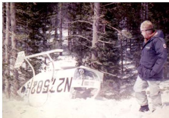
Former Mountain Rescue Association President J. Hunter Holloway stands beside the helicopter that crashed while he was aboard.

Less than an hour later, the Bell 206-B attempted to land in “an unauthorized L.Z.” As the helicopter was circling on final approach, it crashed into nearby trees. The helicopter suffered substantial damage as it landed on its side. Three of the four passengers were injured. The rescuer walked away from the scene. An Army Chinook helicopter, assisting in the search, landed near the crash site, and evacuated the four passengers.