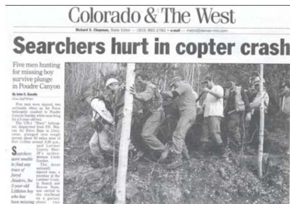
Headlines of the Denver Post describe a line of duty injury to a rescuer from Larimer County Search and Rescue.

The accident investigation board, convened by the AFSPC commander, Gen. Richard B. Myers, concluded the helicopter crash was caused primarily due to the mission pilots flying too low and too slow for the altitude, terrain, and winds/turbulence (sic). Once the aircraft began to sink, they did not have enough power, airspeed, or altitude to recover. xxiii