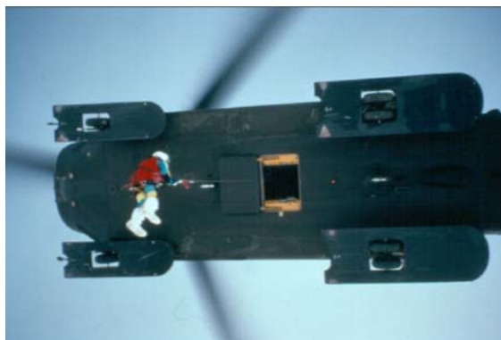
A hoist operation through the "Hell Hole" of a Chinook helicopter.

In the middle of the lowering, high winds forced the crew to reverse the winch in an attempt to raise Givler back into the helicopter. During the raising, the combination of the backpack and horse-collar pinched a nerve in Givler's upper body, causing him to lose all sensation in his arms. Just as rescuers on board the helicopter began to pull Givler aboard, he slipped from the horse collar and fell from the helicopter.