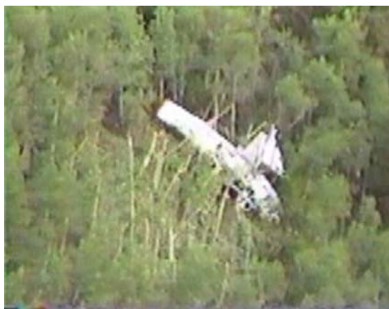
Pilot Terry Leadens died in the line of duty when his Civil Air Patrol single engine Cessna crashed during a search for a missing hiker.

fixed wing flights, especially in the trenches. The broken trees indicated a descent angle of 45 degrees. The distance from the first tree strike to the main wreckage was 62 feet. The aircraft came to a rest on its nose. The terrain elevation was about 10,600 feet MSL. ix