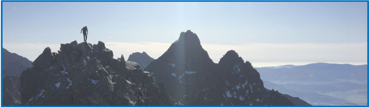
View from summit of Rysy, highest peak in Poland