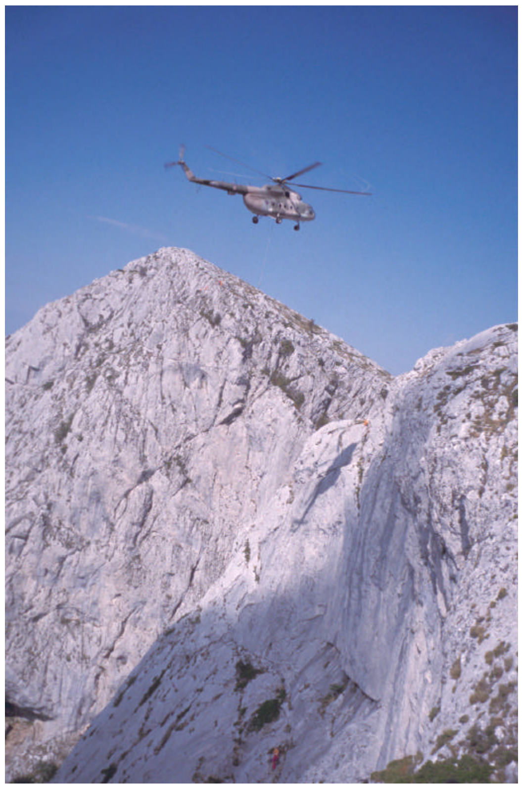
The third demonstration was the deployment of a search dog-handler and dog using the hoist on the MI8. Once clear of the hoist, the handler sent the dog harness back up on the hoist. While it was brought up, the harness was spinning around and it nearly got caught in the blades.

the ring, the helicopter could lift the load up and away from the cliff to a nearby staging are. This operation presumably required careful communications between crew members inside the aircraft and rescuers on the ground.