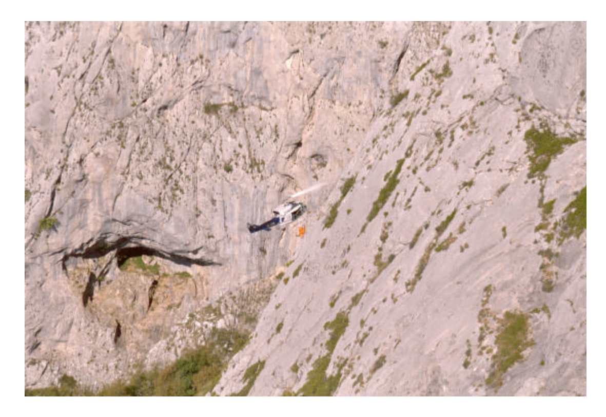
In the second scenario, rescuers were hoisted to the top of a cliff with the MI8.

Rescuers and victims were then extracted by using the hoist on the BH212.