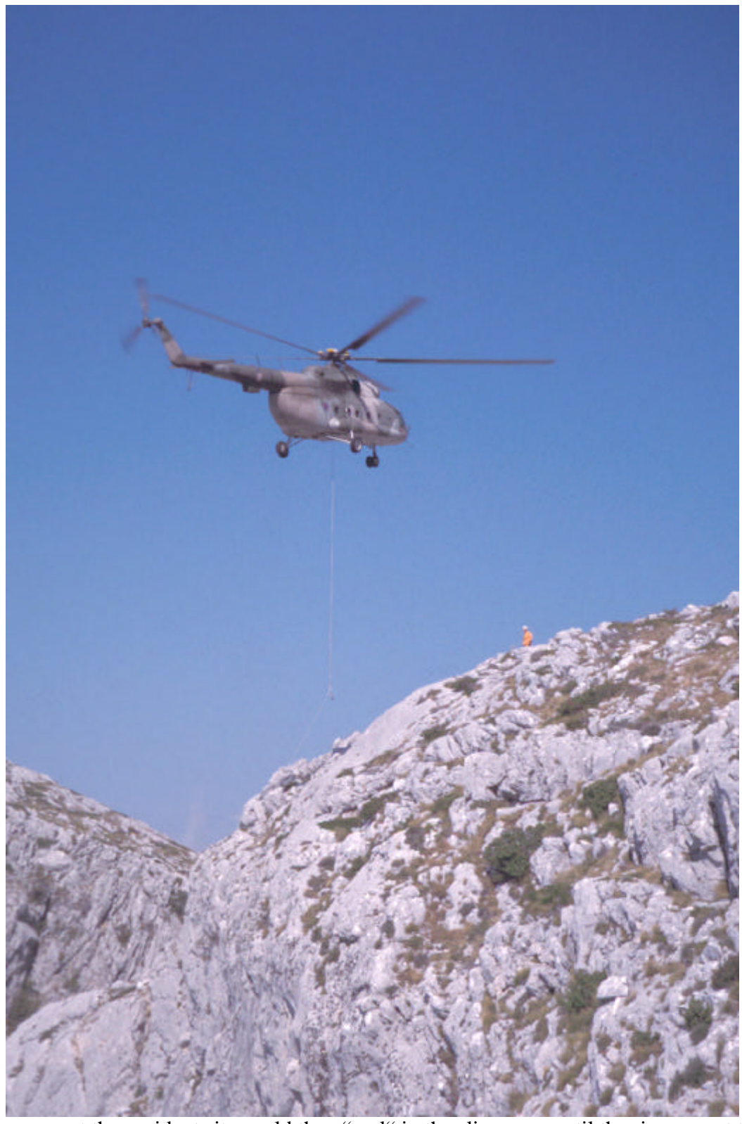
The rescuers at the accident site could then "reel" in the sling rope until the ring was at their level. This rope was then locked off inside the aircraft. Once the rescue load was attached to

The rescuer at the top of the cliff attached this sling rope to the static line that the rescuers had used to reach the victim.